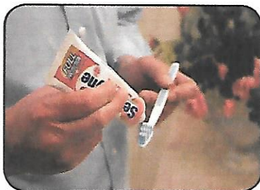
Use a desensitizing toothpaste