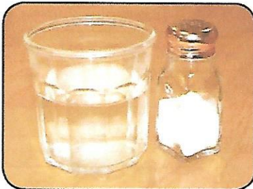
Rinse with warm salt water

To keep your temporary bridge in place, avoid eating hard or sticky foods, especially chewing gum. If possible, chew only on the opposite side of your mouth.