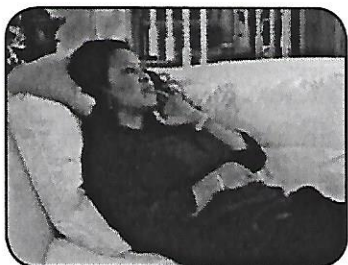
Lie down with your head elevated