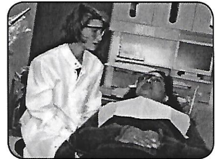
Discussing post-op instructions

To control discomfort , take pain medication before the anesthetic has worn off or as recommended.